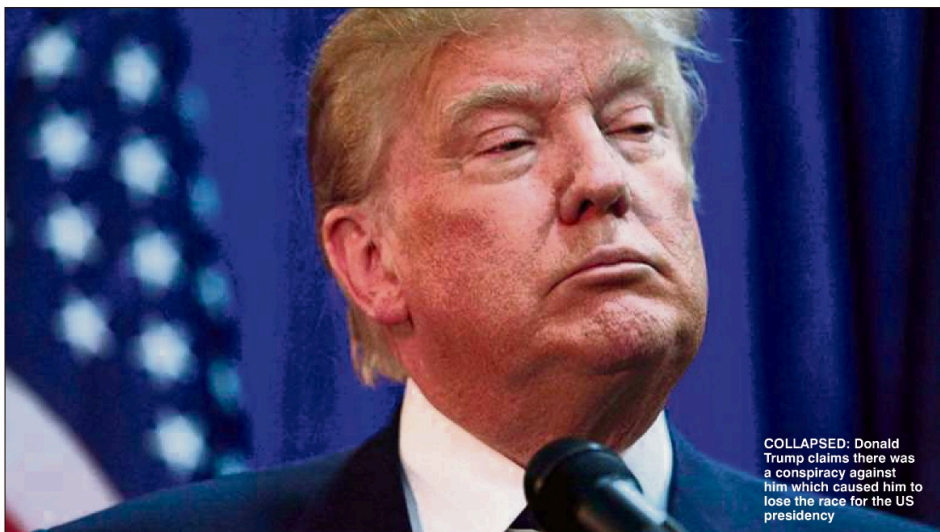
COLLAPSED: Donald Trump claims there was a conspiracy against him which caused him to lose the race for the US presidency