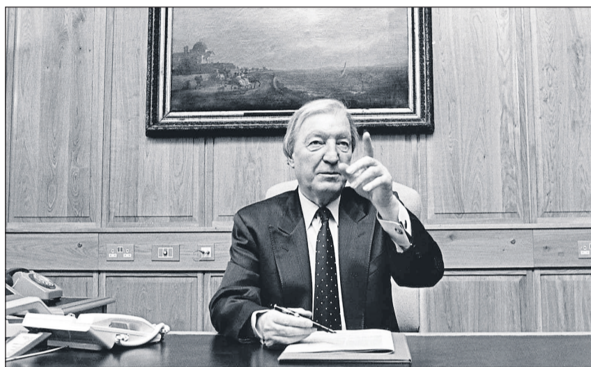
■ TARGET: Records from Charlie Haughey's office while he was taoiseach reveal the UVF wrote to tell him of a smear campaign against him

letter, on UVF headed paper, showed the loyalists told Mr Haughey that the MI5 operative gave details of his cars, photographs of his home, his island, Inishvickillane, and his yacht, Celtic Mist.